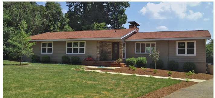
4832 Brookhaven Drive - Raleigh, NC