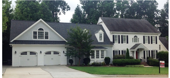
8408 Clarks Branch - Raleigh, NC